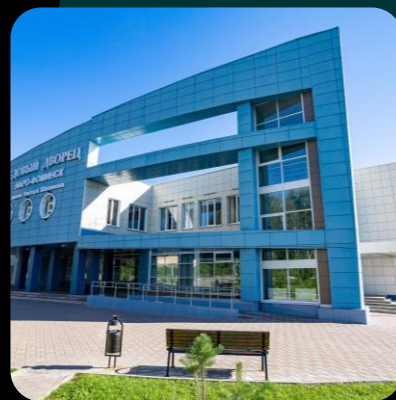
Package solutions for aluminium facades