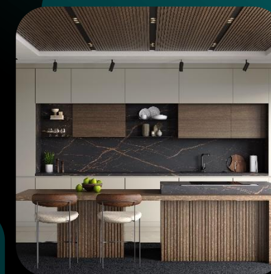
Furniture component parts